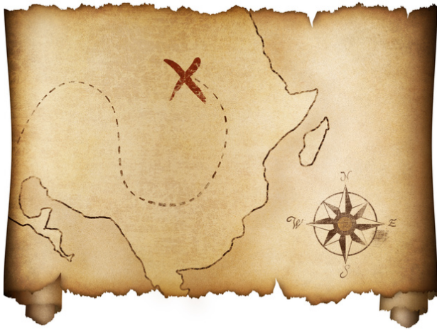
PHOTO SCAVENGERHUNT 21 MAY Pizza provided and prizes for the winning Team